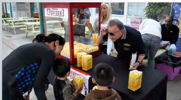
Heard it on Facebook: Hollygrove is a favorite among Young Variety volunteers who return every year to host a Halloween carnival.

priceless memories. Young Variety is an organization for entertainment industry professionals over age 21. ♥