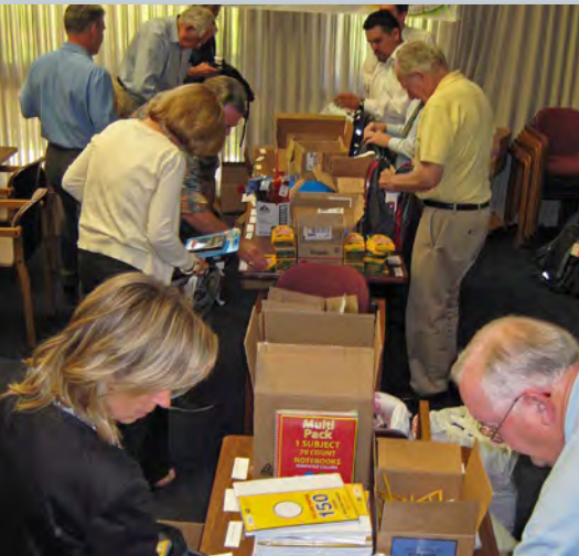
The Campbell Rotary came through with 220 backpacks, making the difference this fall for school children who otherwise would have been without needed supplies.

Thanks for all you do for kids in crisis! ♥