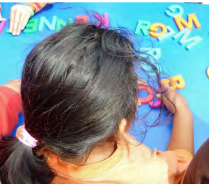
Kids learn that literacy can be fun!

Building on the continued success and popularity of Camp Hollygrove and in response to overwhelming need in our community, this fall we launched a new after-school program on our campus called Endless Summer. It offers many of the same therapeutic and enrichment activities as Camp Hollygrove, along with a focus on literacy and school achievement.